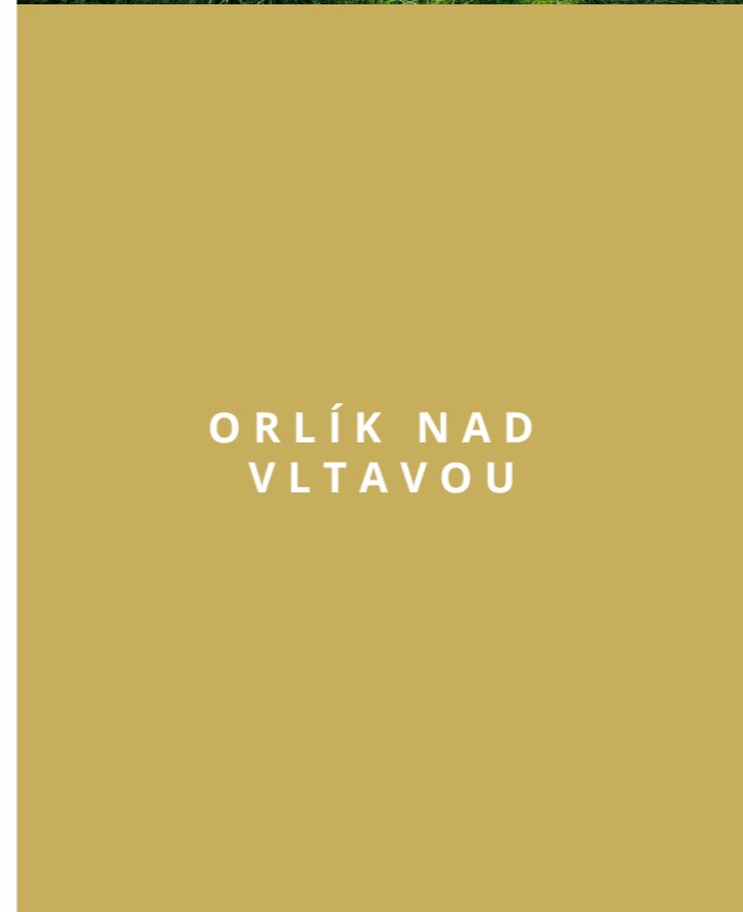
ORLÍK NAD VLTAVOU